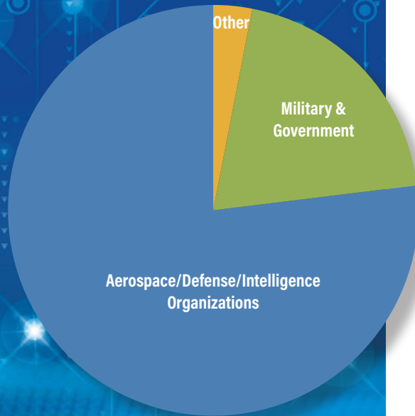
Buying Interest in Geospatial Intelligence Products and Solutions