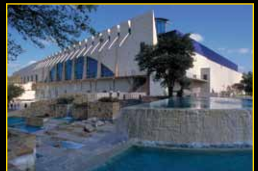
Henry B. Gonzalez Convention Center San Antonio, Texas

GEOINT returns to San Antonio for the eighth annual Symposium! USGIF invites you to join us at one of the GEOINT Symposia's favorite cities, San Antonio, for the GEOINT 2011 Symposium. As in previous years, the GEOINT Symposium will capture attendees with intriguing keynotes, morning panels and afternoon breakout tracks from the GEOINT Community's most prominent leaders. Attendees and exhibitors alike, will be able to learn about current trends and innovations in the exhibit hall, filled with technologies from organizations creating products and programs to better our nation's security. GEOINT 2011 also promises rare networking opportunities through multiple receptions and evening events. Mark your calendar for this must-attend event, you won't want to miss out!