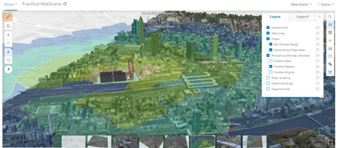
Figure 3. Draped GIS content greatly enhances reality mesh and provides for easy-to-use web experiences to support mobility analytics.